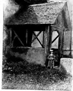
VIEWS SHOWING THE WEST PORCH AND INTERIOR OF ST. MARGARET'S CHURCH, TOPPESFIELD, ENGLAND.